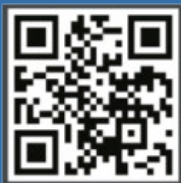
Mt. Carmel Website